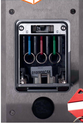
Electronic key ring tag